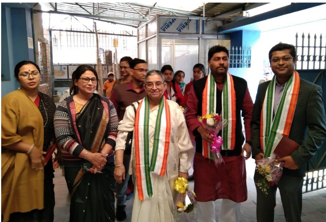
North 24 Parganas, 19.01.2023