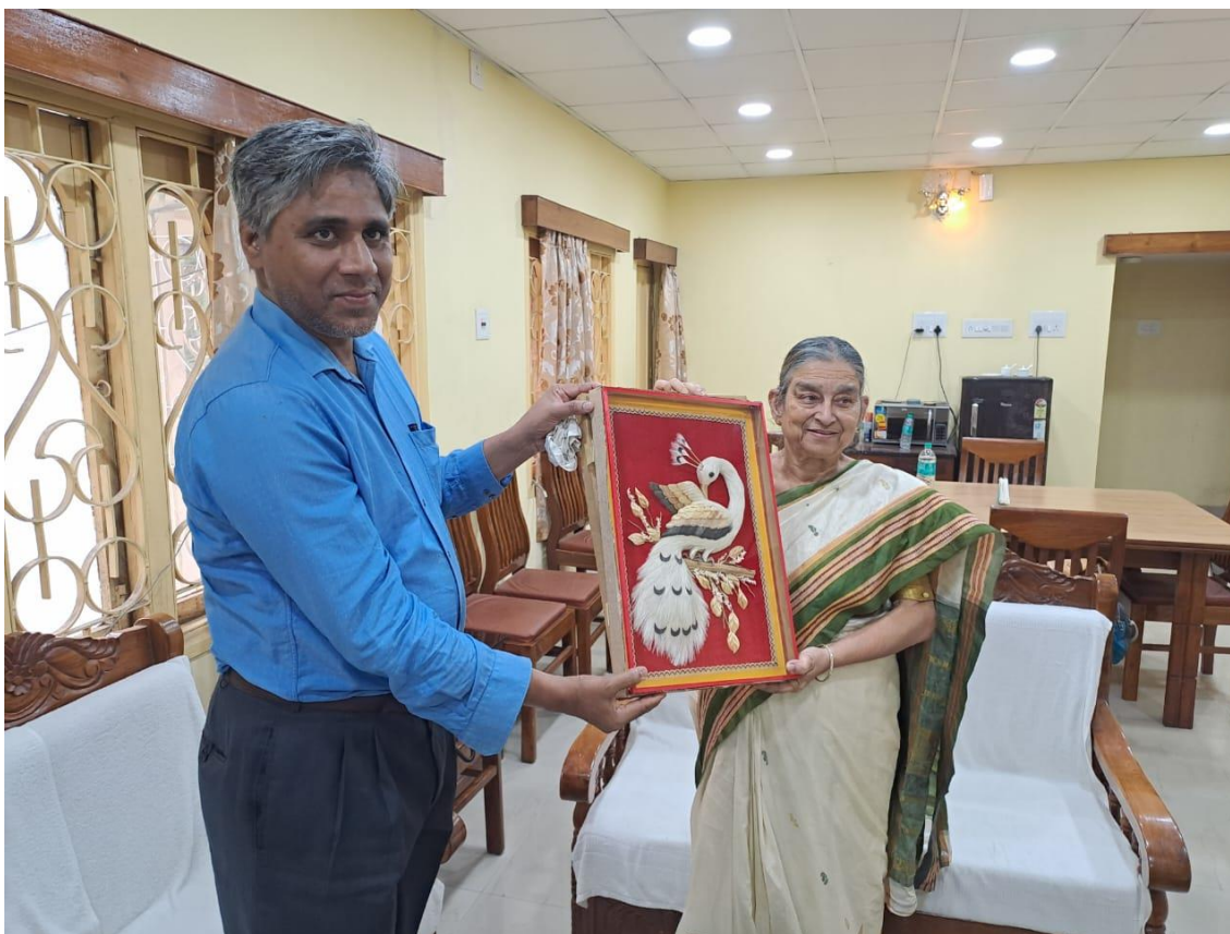
Purba Medinipur, 15.02.2023